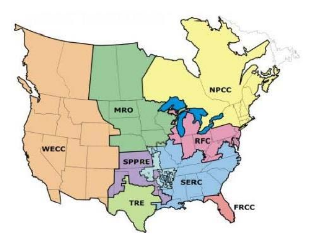
Note: The highlighted area between SPP RE and SERC denotes overlapping Regional area boundaries. For example, some load serving entities participate in one Region and their associated transmission owner/operators in another.

NERC assesses and reports on the reliability and adequacy of the North American bulk power system, which is divided into eight Regional areas, as shown on the map and table below. The users, owners, and operators of the bulk power system within these areas account for virtually all the electricity supplied in the U.S., Canada, and a portion of Baja California Norte, México.