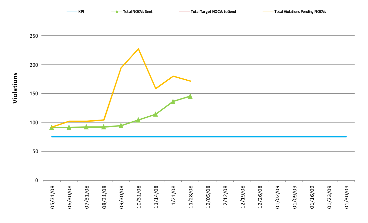
NOCV's Backlog Glide Path

KPI: Less than or equal to 75 NOCVs pending