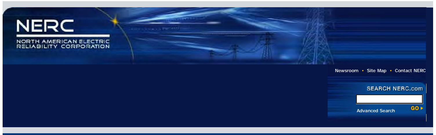
► About NERC ► Standards ► Compliance ► Assessments & Trends ► Events Analysis