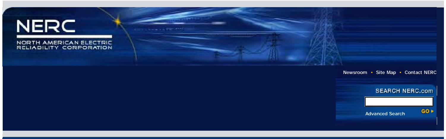
► About NERC ► Standards ► Compliance ► Assessments & Trends ► Events Analysis