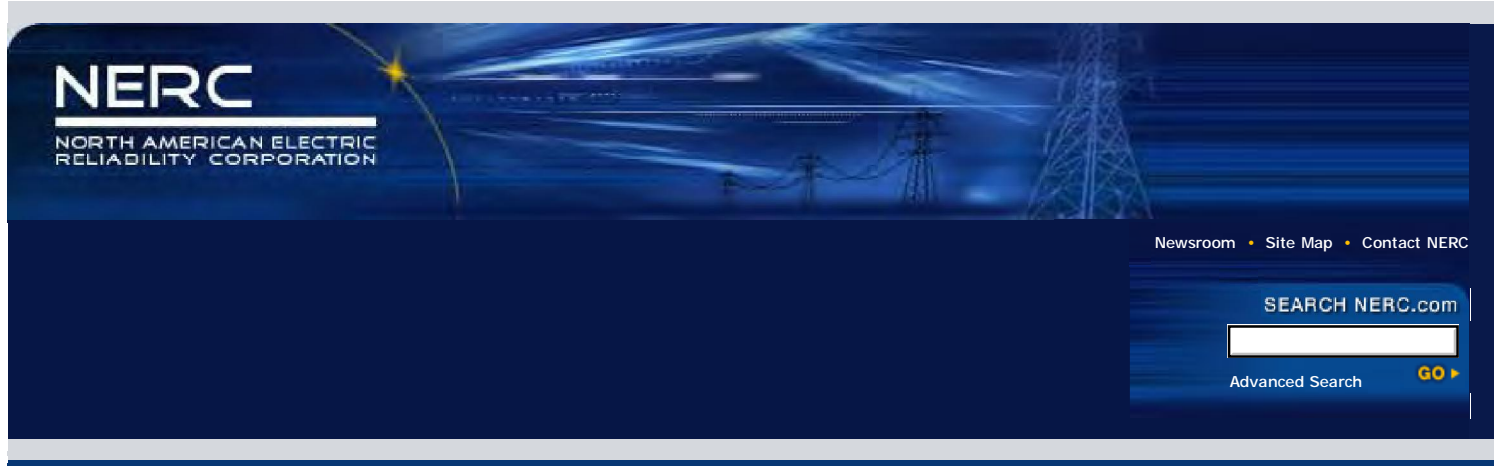
► About NERC ► Standards ► Compliance ► Assessments & Trends ► Events Analysis