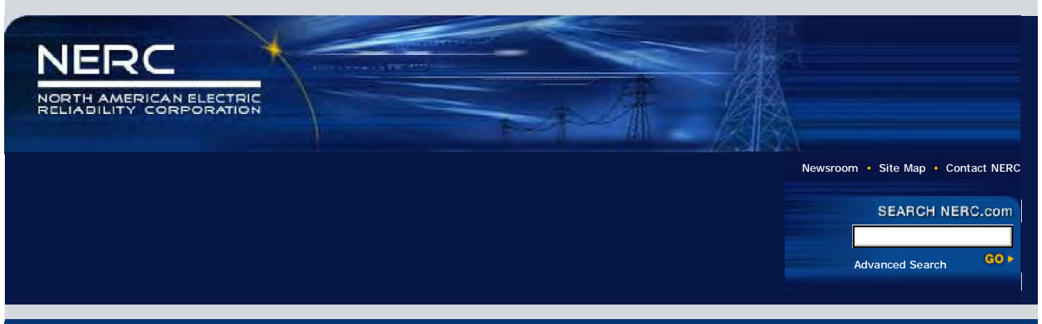
► About NERC ► Standards ► Compliance ► Assessments & Trends ► Events Analysis