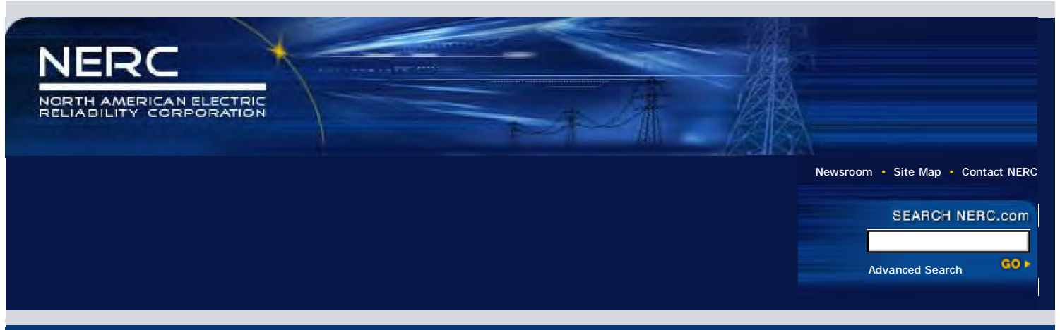
About NERC Standards Compliance Assessments & Trends Events Analysis